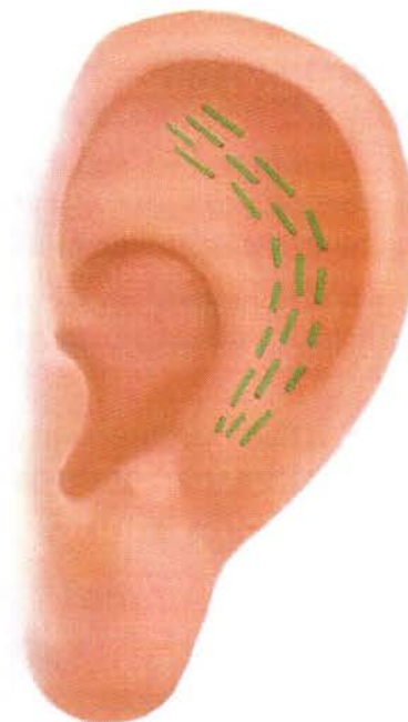
Scoring on the inside of the ear

Your surgeon will pack your ears with moulding material and place a dressing on your head to give your ears support.